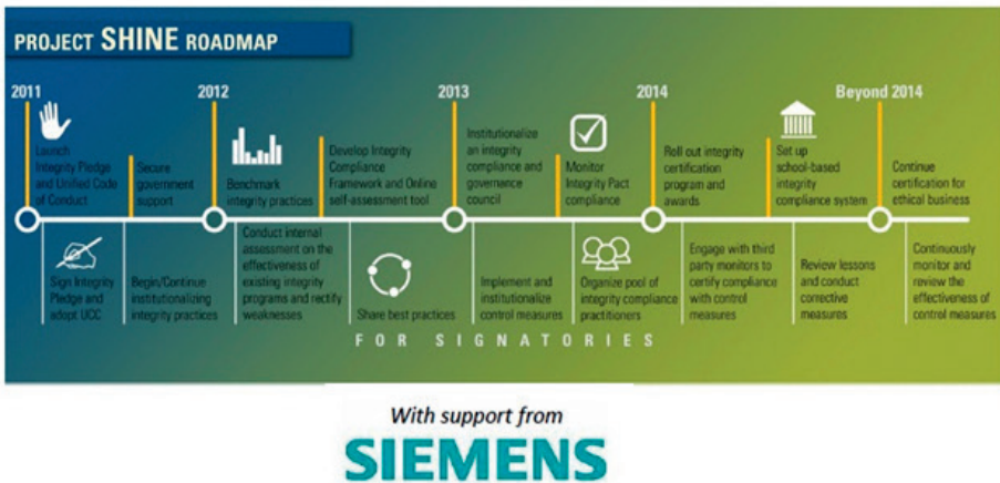
Figure 1: Project SHINE Roadmap

The four-year roadmap of Project SHINE has the following milestones and specific activities: