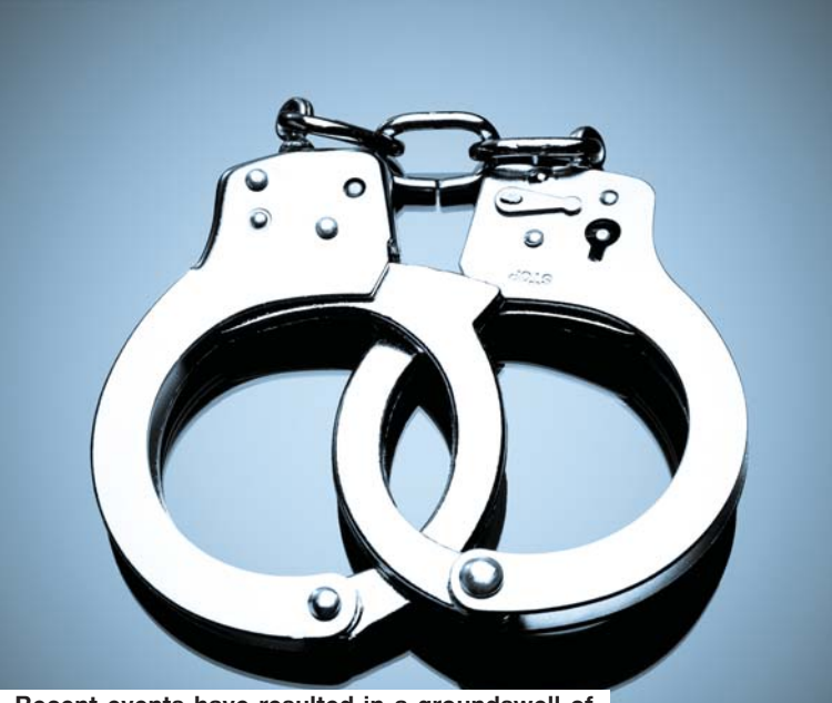
Recent events have resulted in a groundswell of public opinion against corrupt practices, whether in the private or public sectors