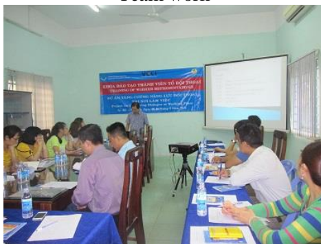
Trainees at the training workshop