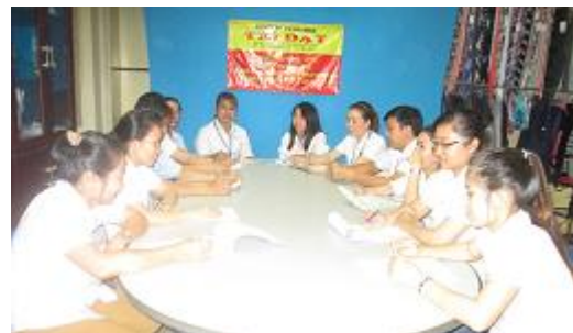
Dialogue at Tri Dat Company