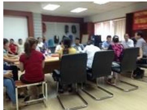
Dialogue at Jadeluck Company