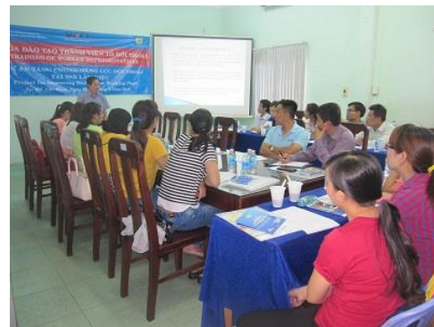
Trainees at the training workshop