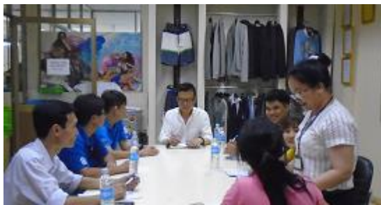
Dialogue at Shillag Bag Vietnam Company