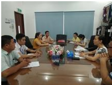
Dialogue at M&J Garment – Print – Embroidary Company